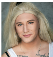
WOMAN IN AUDITORIUM, MIDDLE AGED WOMAN