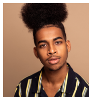
PROFESSOR OF CREATIVE WRITING, MANAGER