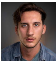
TOM'S FATHER, SHOOTER